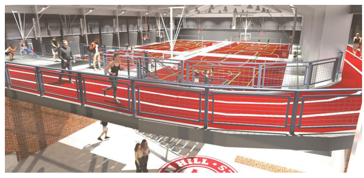
Design renderings of Indian Hill School District fieldhouse concepts by Oswald Company.

The Indian Hill Board of Education passed a resolution to proceed with additional preconstruction work for a new Athletic Fieldhouse to serve the entire community during their regularly scheduled meeting on February 20; additionally, the Village of Indian Hill Planning Commission approved the construction of the new indoor facility. Construction of the project is projected to be majority funded from private donations now totaling an estimated $10 million; the approval was for the total project to not exceed $12 million.